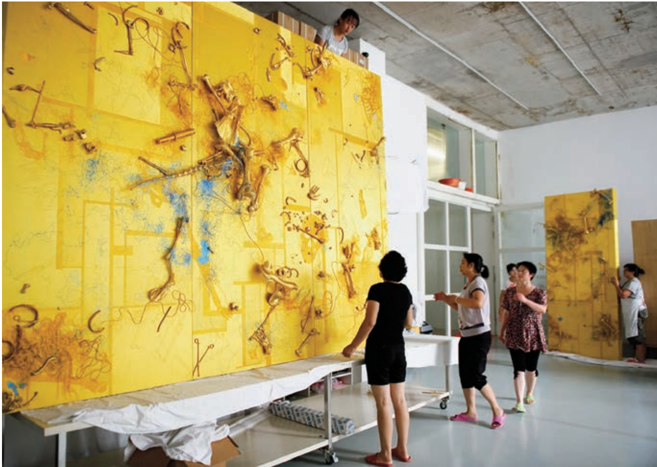
Lin's assistants at work in her studio packing The Golden Mean , 2012, for shipment to the Asia Society in New York. The fourth panel of the piece is in the background. The detail below shows synthetic bones and implements wrapped in gold thread and applied to golden fabric embroidered with skulls, bones, and flowers to suggest a memento mori.