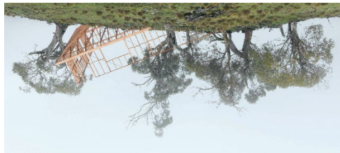
Rosemary Laing, Prowse , 2010.

Galerie Lelong & Co., New York, is honored to present a tribute exhibition to Australian artist Rosemary Laing (b. 1959 - d. 2024). In 2002, we presented her first solo exhibition in the United States, bulletproofglass , which inaugurated a close relationship that would lead to solo exhibitions one dozen unnatural disasters in the Australian landscape (2004), weather (2007), a dozen useless actions