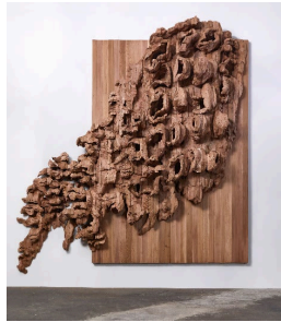
Ursula von Rydingsvard, OBUDOWAĆ , 2020-21.

Opening Thursday, October 27, 2022, 6:00pm - 8:00pm