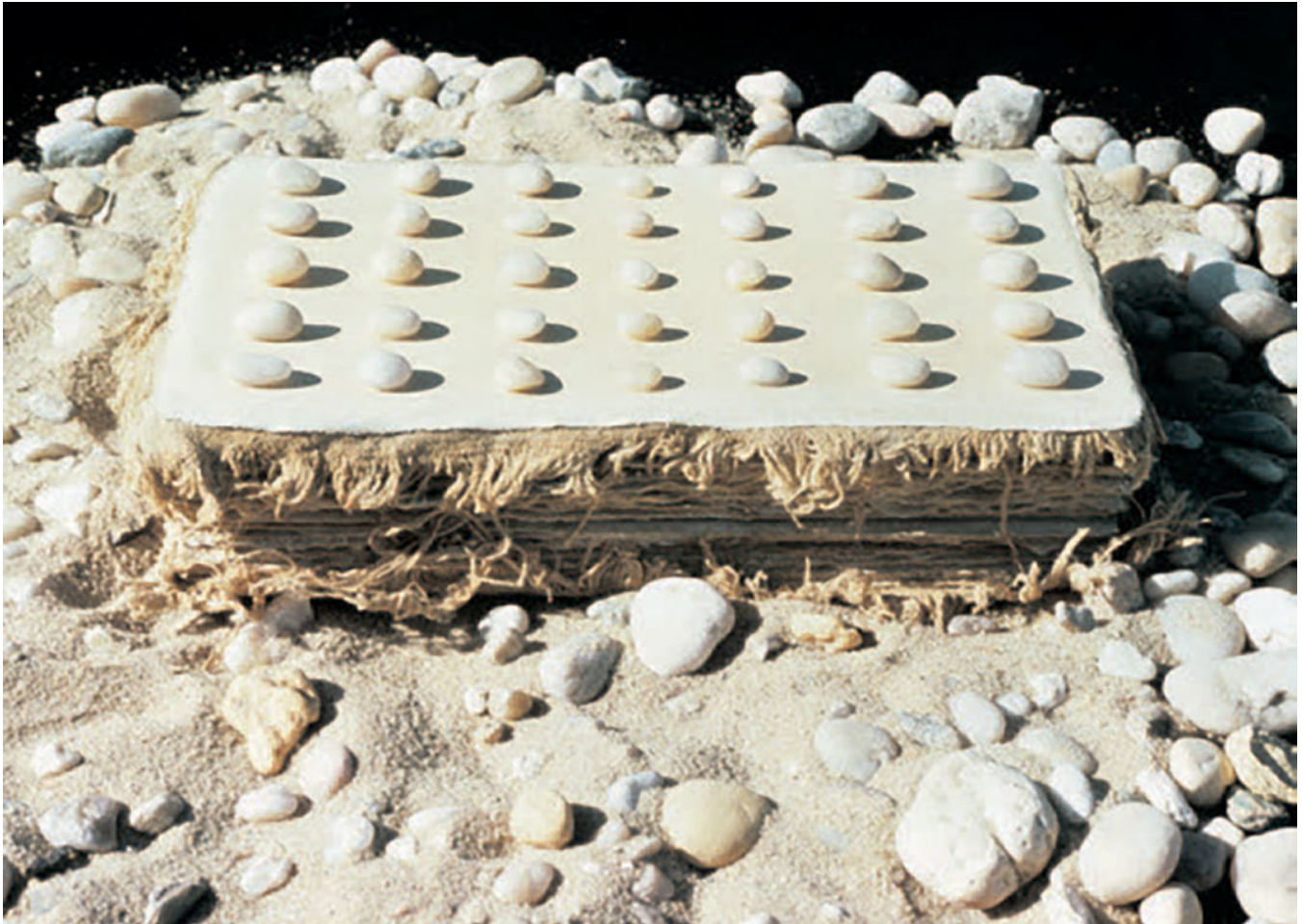
Michelle Stuart, Every Wave Book (for Melville) , 1979 , earth, sand, and sea pebbles from North Shore of Long Island, linen, muslin-mounted rag paper, 8 × 14 × 3 1/2".

took the drafting job in the early 1950s in part to pay for classes at the Chouinard Art Institute, one of many art schools she attended.) As installed, they mimic drapery, which seems fitting considering that the Latin mappa (as in mappa mundi ) denoted textiles. The earliest known maps related to astronomy, their constellations of marks not far from the speckles of dust that pepper Stuart's rubbings. (In the '60s, she, like Vija Celmins and other contemporaries, made works based on images of the moon obtained from NASA.)