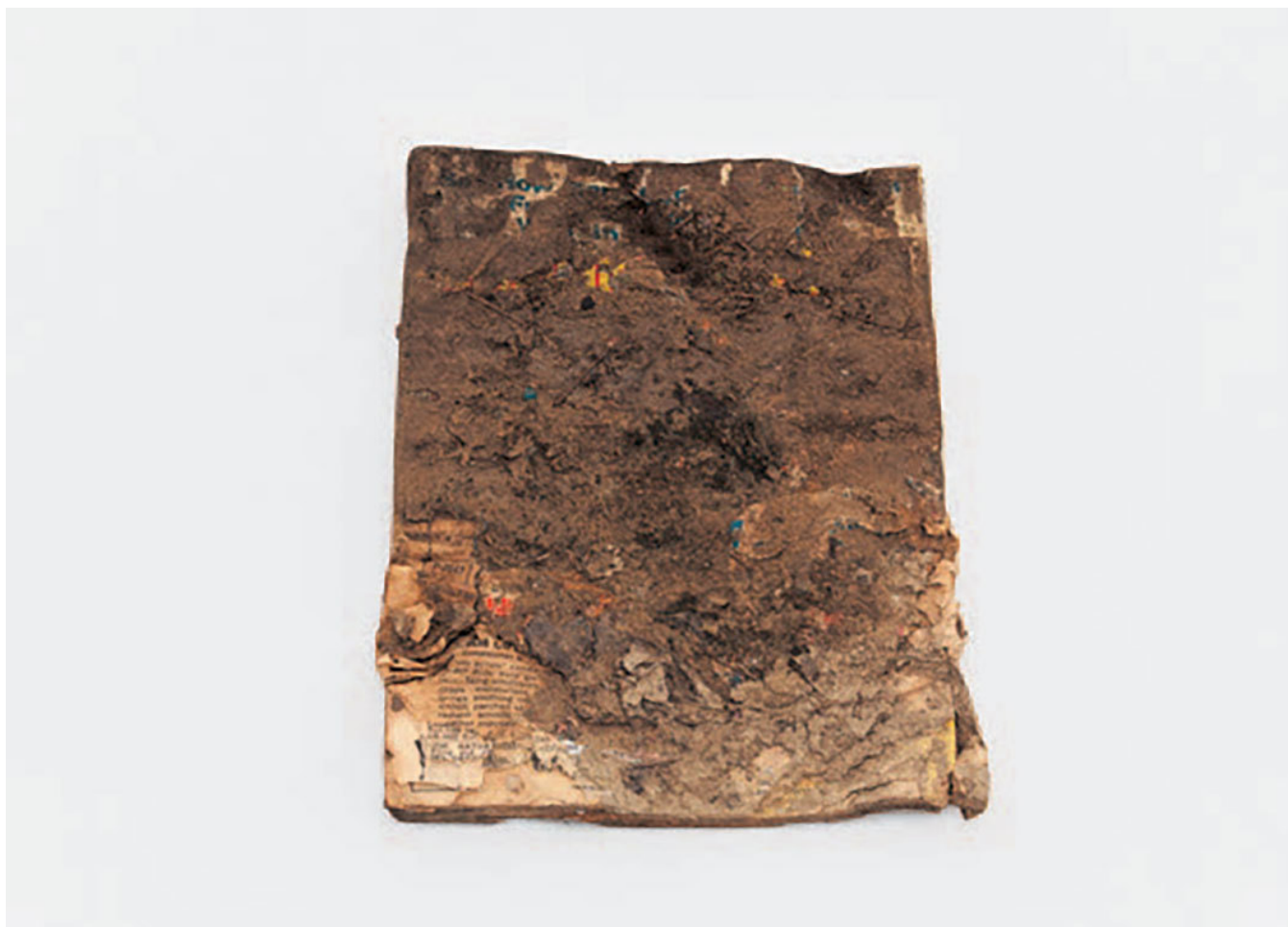
Michelle Stuart, Natur Far , 1984 , earth, paper, organic material from Cahokia Mounds State Historic Site, Collinsville, IL, found book, 8 1/8 × 6 1/4 × 3/4".

many of her books is itself a stand-in for memory. Dirt, seeds, and pigments are captured within it. The pages, thick with the viscous medium, might almost be a solid block.