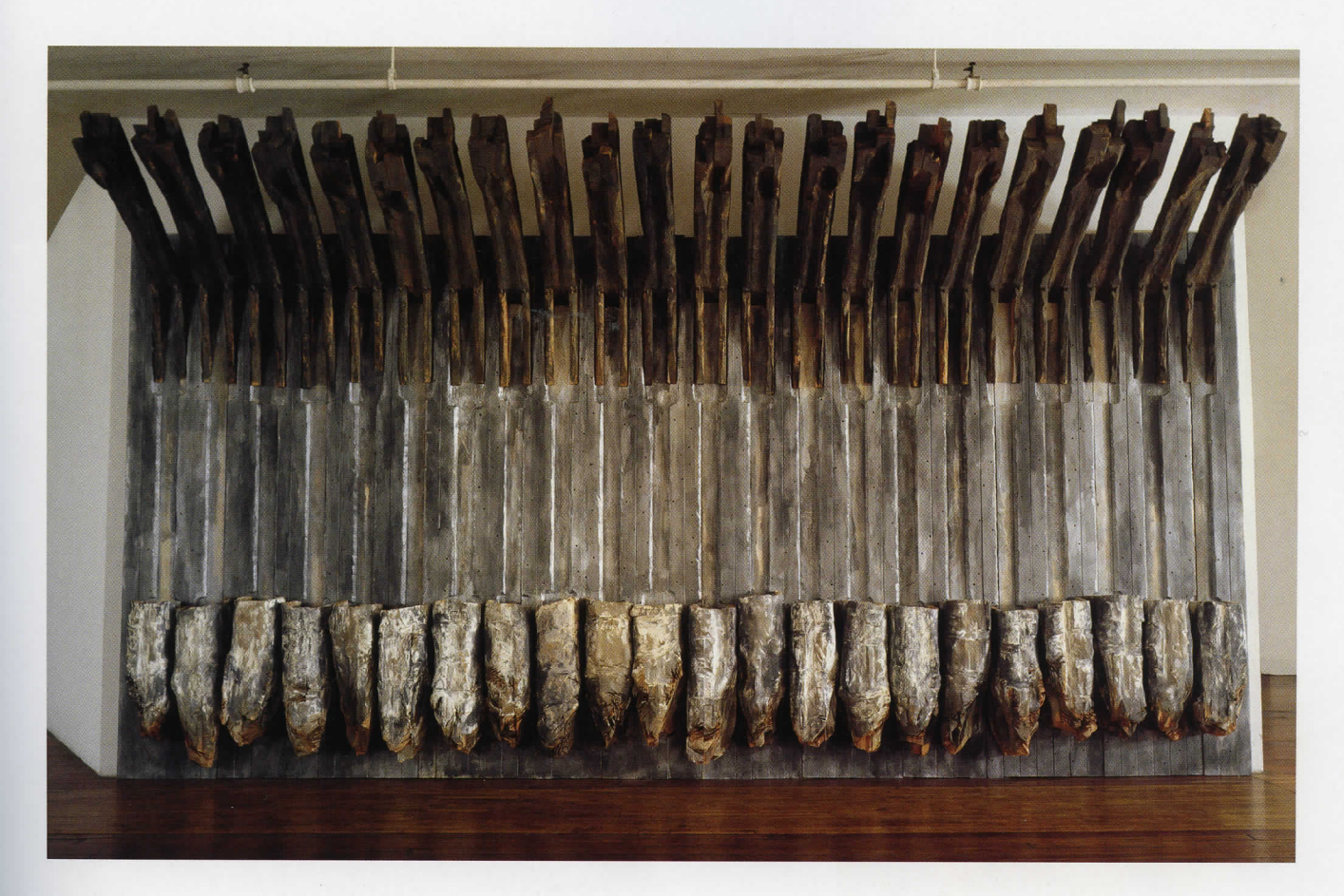
Zakopane, 1987. Cedar and paint, 11.5 x 22 x 3 ft.

the environment, the patina of the copper will transform across the decades. von Rydingsvard's new work is able-bodied and brawny, its surface folds cresting and melding into one another. It will sit directly on the ground, refusing a platform or pedestal as it unites with the site.