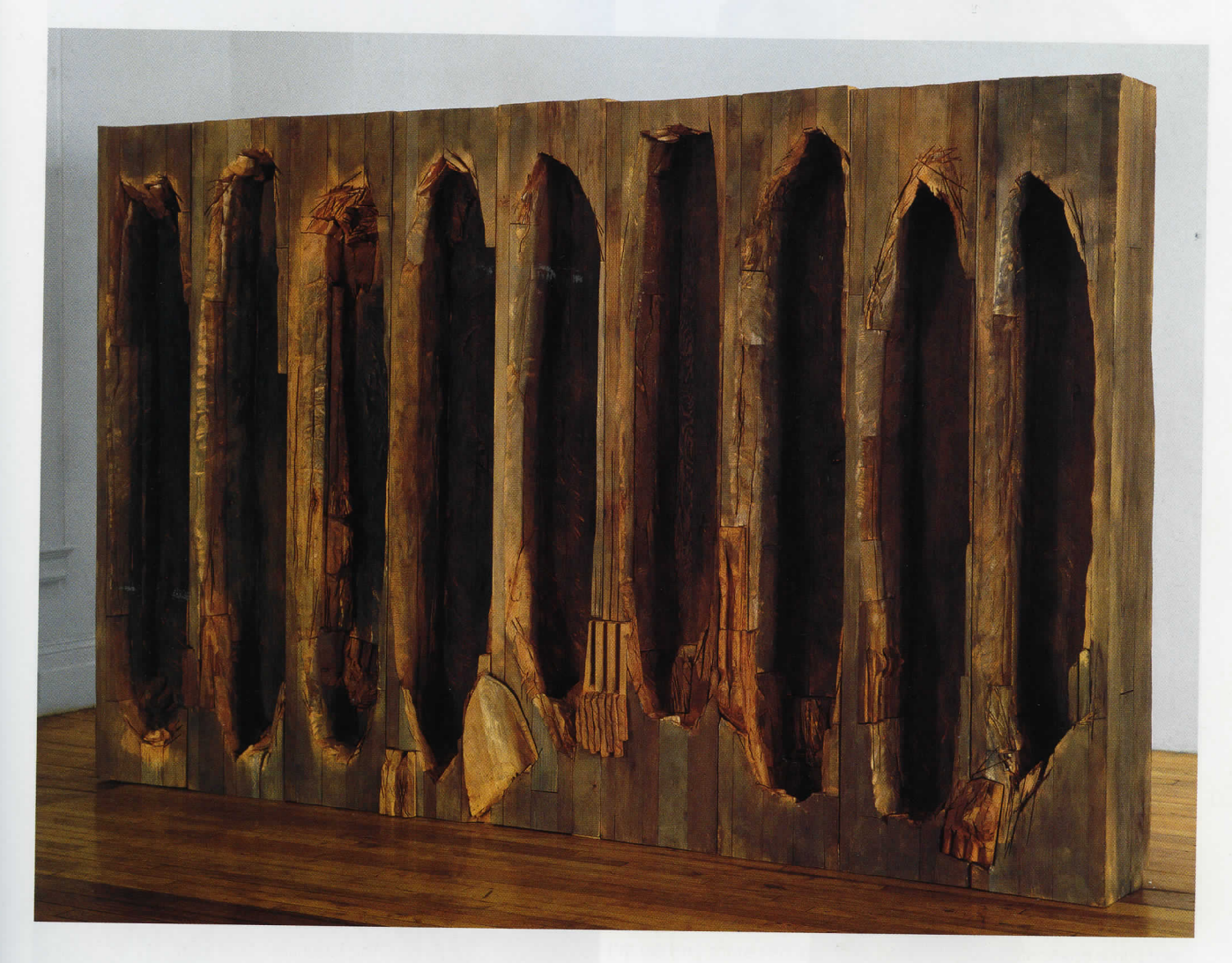
Umartes (You Went and Died), 1987-88. Cedar and stain, 6.5 x 10.67 x 1 ft.