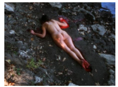
Ana Mendieta, Still from Silueta Sangrienta , 1975.

Frieze London Stand A03 London, England October 4-7, 2018