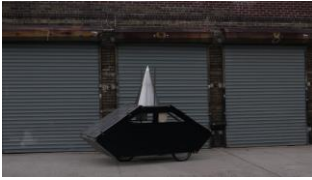
Krzysztof Wodiczko, Poliscar Variant 2 , 1991/2017

uncertain and unsettled environment that calls into question whether the work is opening or closing, and if the threat of the bullets is real or perceived.