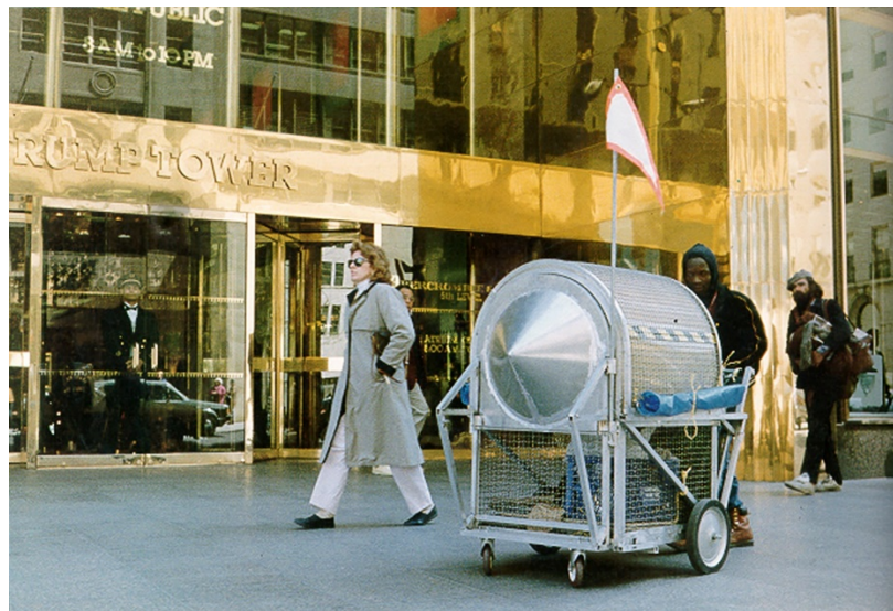
Mr. Wodiczko’s “Homeless Vehicle Project,” 1988-89. Above, Variant 3 at Trump Tower, New York.

It wasn’t designed as a solution but to expose a situation “that should not exist in a civilized world,” said Mr. Wodiczko, who showed photographs of the men and these structures in an art gallery.