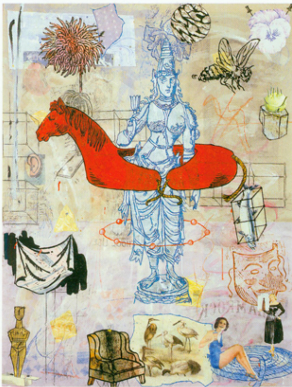
Jane Hammond, Silver Rider , mixed media on Japanese paper (42-1/2x32-1/2 in.), 1999. Courtesy private collector, New York.

JH This is from a novelty catalogue I bought at an old book fair. I Xeroxed the images. I turned the Xeroxes into lithographs—a little homemade kind of print process. I do them here, in the studio.