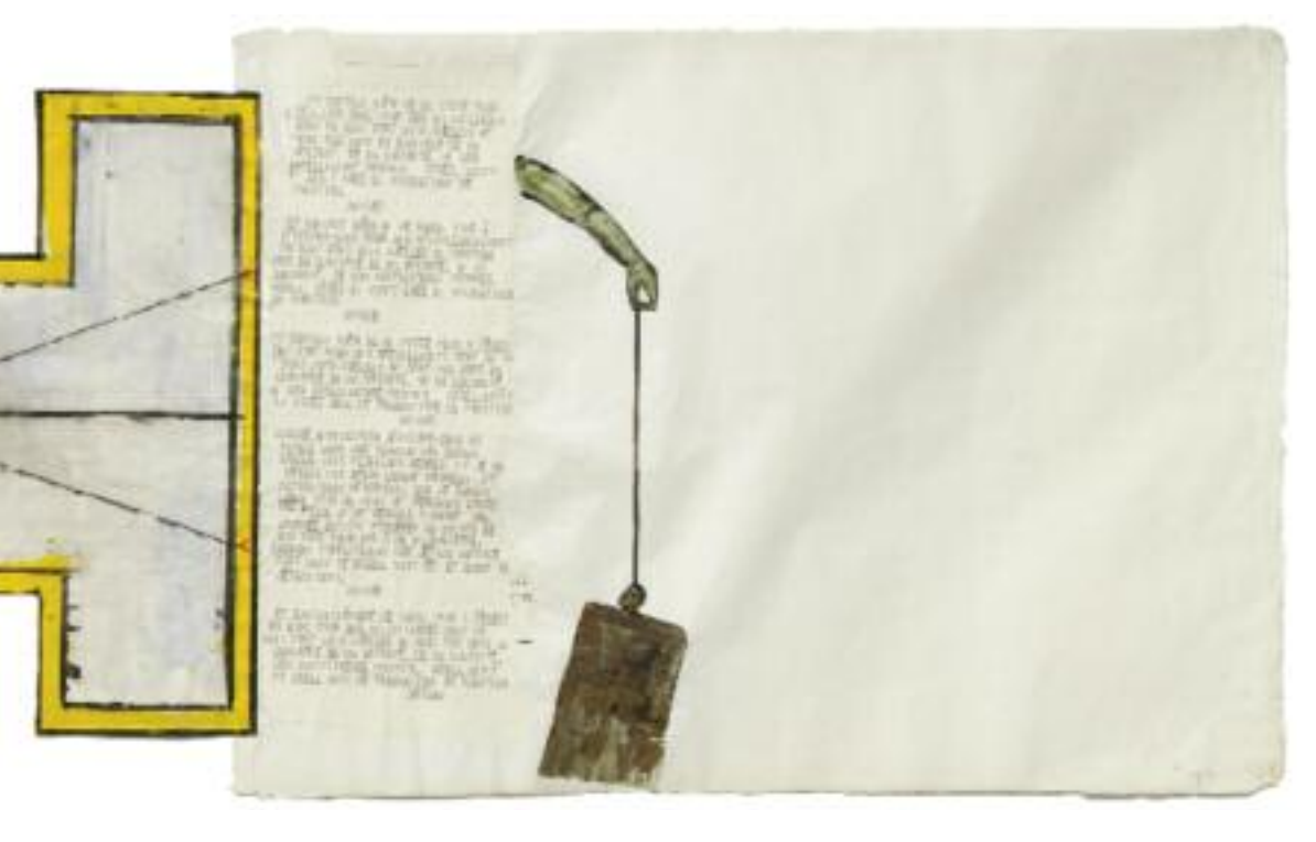
Codex Artaud III, 1971, is based on playwright Antonin Artaud's manifesto The Theater of Cruelty, portions of which Spero typed on paper and collaged into a scroll.

period. The looming figures, painted as if glimpsed through a torn veil or scrim, portray mothers, intercourse, and childbirth. Their disturbing palette may have derived from being painted mostly at night. In these works Spero first addressed one of her central themes: language as a voice for the disenfranchised. "It was particularly one of the Black Paintings," she explains, "in which there's a figure coming out of a kind of angel—the figure is a woman with four breasts and wings instead of arms, and it's about eight feet tall. It's a profile, so out of her mouth comes this head, this little figurine, that had to do with speech. It was like a birth of language, not of a human being."