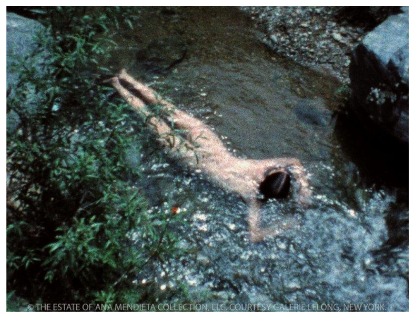
Ana Mendieta, Creek (1974) Super 8 film, color, silent.

"We know now that the images of blood that are typically presented as emblematic of her filmworks account for a small fraction of her overall filmic production," Oransky writes.