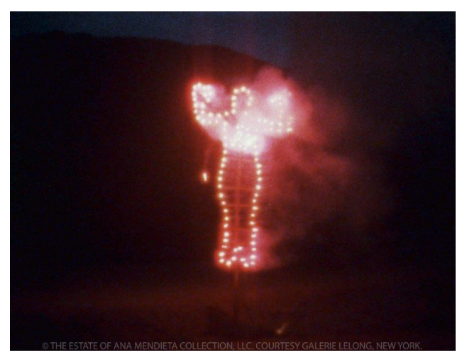
Ana Mendieta, Anima, Silueta de Cohetes (Firework Piece) (1976) Super 8 film, color, silent.

"My art is grounded in the belief of one universal energy which runs through everything: from insect to man, from man to spectre, from spectre to plant from plant to galaxy," Mendieta said.